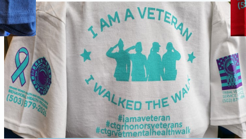
US Coast Guard