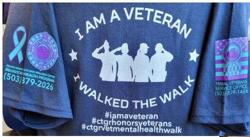
US Navy Shirt