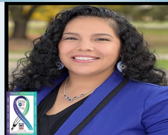
IT2(SW) ~ United States Navy