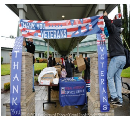
Veterans Day Drive Through Event, 2021