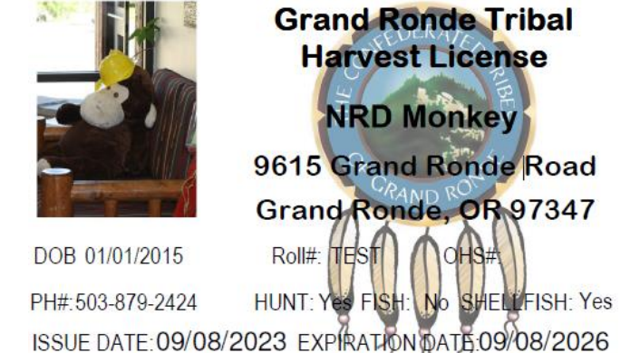
Fig. 2 "New" Grand Ronde Tribal Harvest License""

For species that do require a special fishing tag, (salmon, steelhead, sturgeon and halibut) you can come to the Natural Resources Department to acquire a "Combined Angling Tag, or Hatchery Harvest Card" (See Fig. 3). Tags <u>MUST</u> be reported to Natural Resources within 30 days after tag expiration.