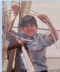
TRIBAL VETERANS SERVICE OFFICE