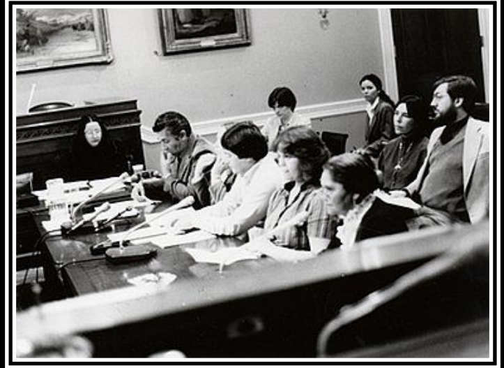
Grand Ronde Restoration Hearing 1983

What do you think the word restoration means?